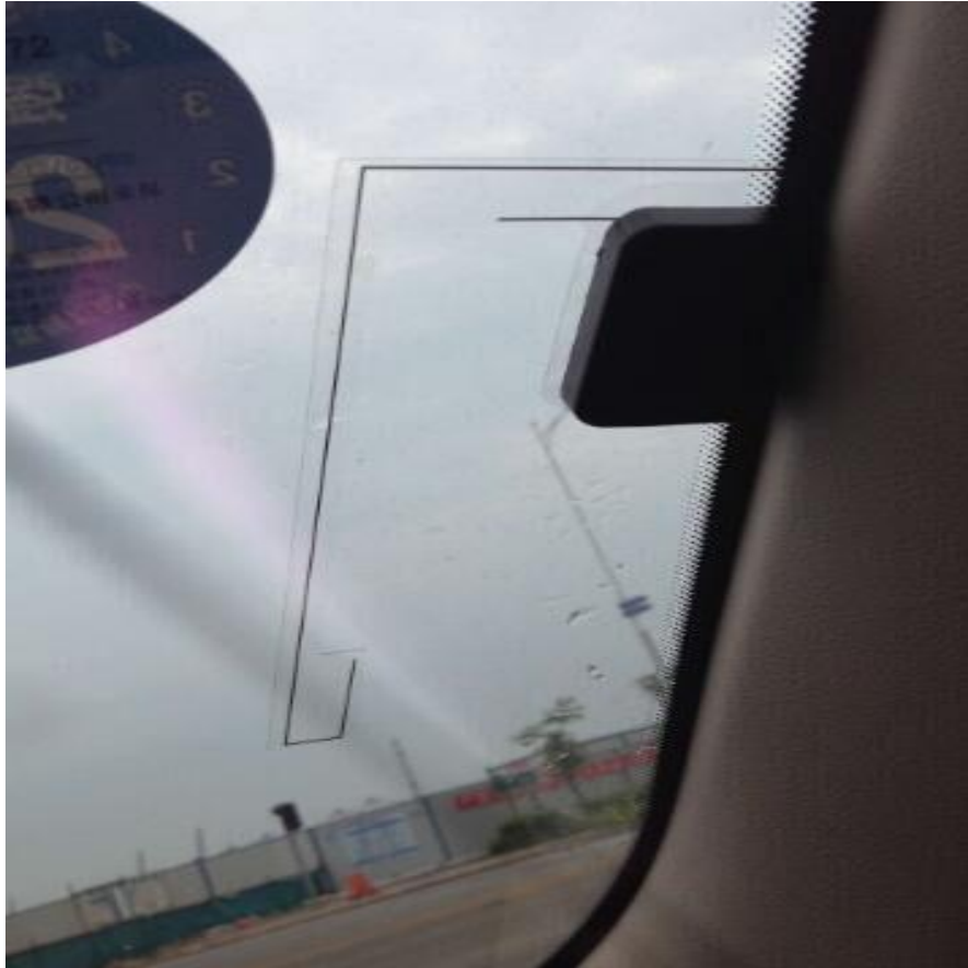
DAB+ Receiver after installation